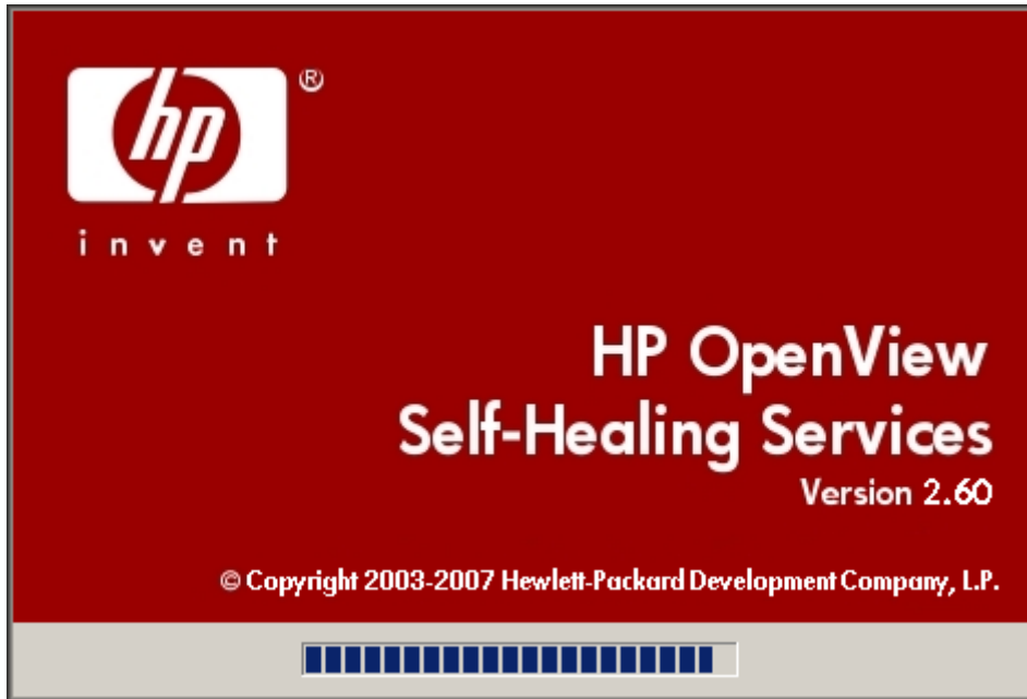
Figure 1 Splash Screen

Shortly thereafter, the installer window opens. The Self-Healing Services installer has nine steps: