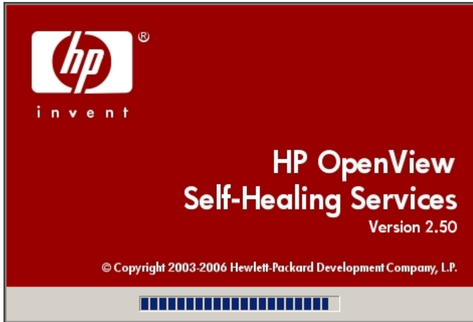
Figure 1 Splash Screen

After the installer initializes, the following splash screen appears: